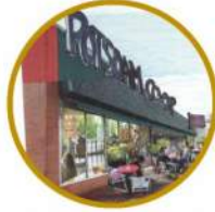
9. Potsdam Food Co-Op Relocation