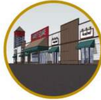
4. Renovation of Market Square Mall