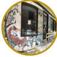
6. North Country Arts Center