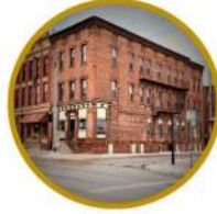
8. 59 Market Street