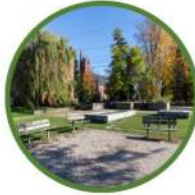
2. Fall Island Skatepark