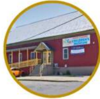
5. North Country Children's Museum