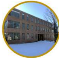
15. Renovation of Damon Hall