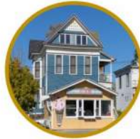
12. The Sandstone