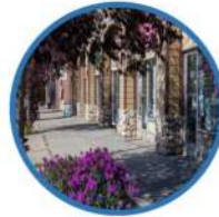
14. Rebuild Downtown Potsdam*