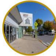
11. Roxy Theatre Alterations