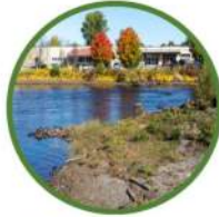
3. St. Lawrence Whitewater Park