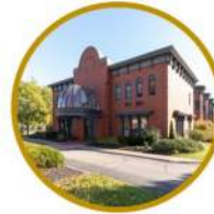
10. The Clarkson Inn Expansion