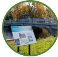
1. Downtown Riverwalk