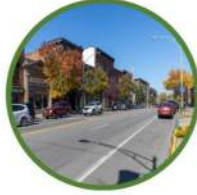
7. Downtown Streetscape Enhancement